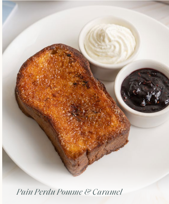
Pain Perdu Pomme & Caramel

La Crêpe Campagnarde DG Savory Crepe with Bechamel, Turkey Ham, Emmental Cheese and Mushrooms. Served with Mixed Salad 65