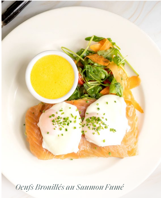
Oeufs Brouillés au Saumon Fumé

Omelette with Organic Eggs DGV Served with a Slice of Toasted Exquisite Bread 40